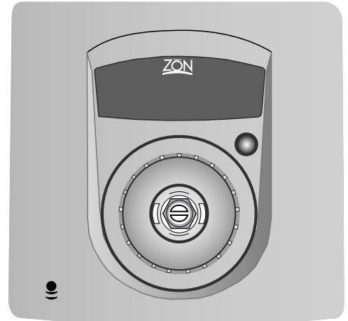
ZAC-60 Jog Wheel Assembly Illustration (Shown without the center button installed)